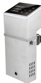
SV-310 MADE IN CHINA