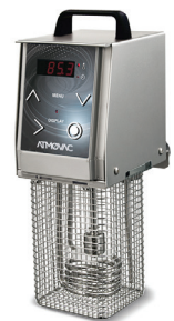
SOFTCOOKER XP 120/230 MADE IN ITALY