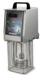
SOFTCOOKER XP 120/230 MADE IN ITALY