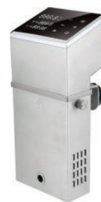
SV-310 MADE IN CHINA