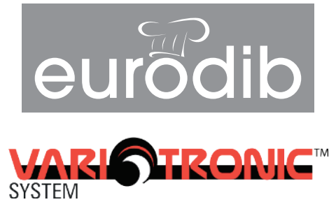
Variotronic: Stabilized speed variator.