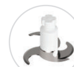
BLADES FOR PESTO