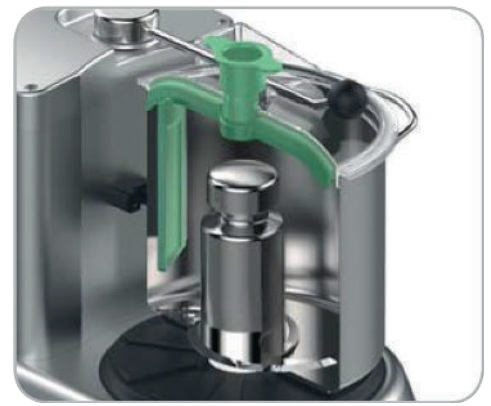
Scraper spatula for cleaning the tank and lid during processing.