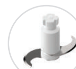
BLADES FOR DOUGH