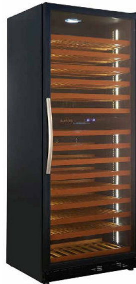
USF328D - Dual Temperature