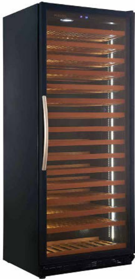
USF328S - Single Temperature